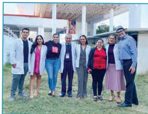
The Guadalajara Research Team and Foundation CEO

To learn more about our research, visit www.drsusanloveresearch.org/research .